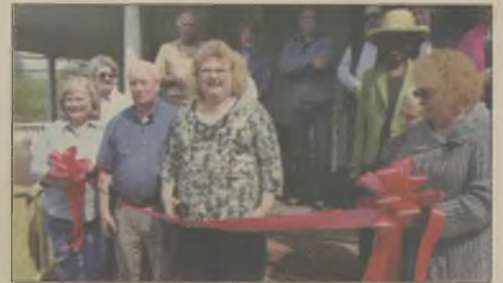
Grandma's Treasures opens, 8