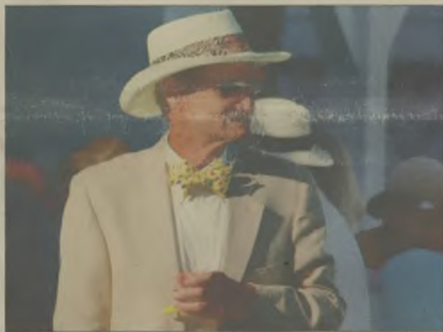
Gentlemen attending sported linen jackets, straw hats and colorful bow ties.

More than 100 people attended the Garden Party sponsored by the Perquimans Restoration Association at Albemarle Plantation, Saturday.