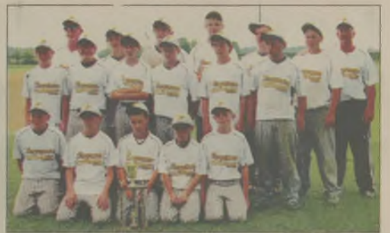
PCMS Tigers finish second, 7