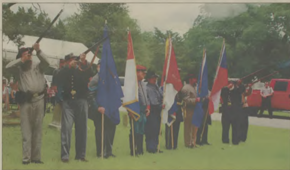
Dressed in Confederate attire, an honor guard fires a 21-gun salute at Saturday's ceremony.

mately 35 people watched the unveiling of the footstone, with gunfire salutes from gray-clad SCV members and the singing of "Amazing Grace" and