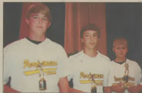
See PCMS sports awards photos, 10