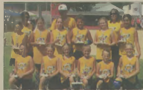
ALL-STARS WIN BIG AT TOURNAMENT, ADVANCE TO STATE PLAYOFFS — PAGE 8