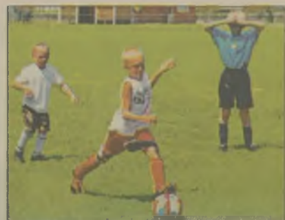
Kids get their kicks in at British Soccer Camp - 8