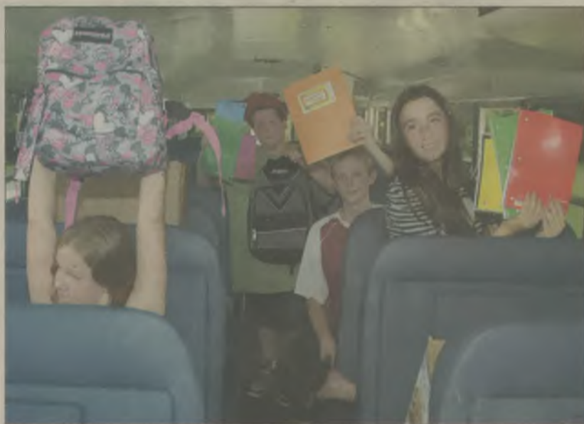
Area students celebrate the "Stuff the Bus" school supply drive on Saturday.