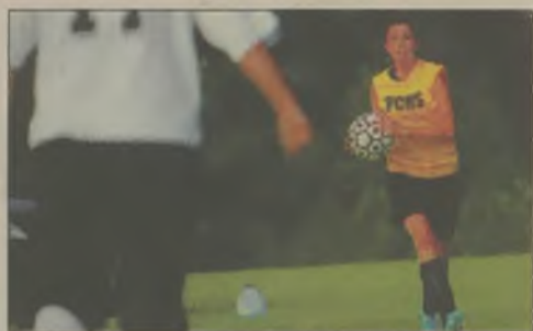
Perquimans fielding area's only co-ed soccer team, 7