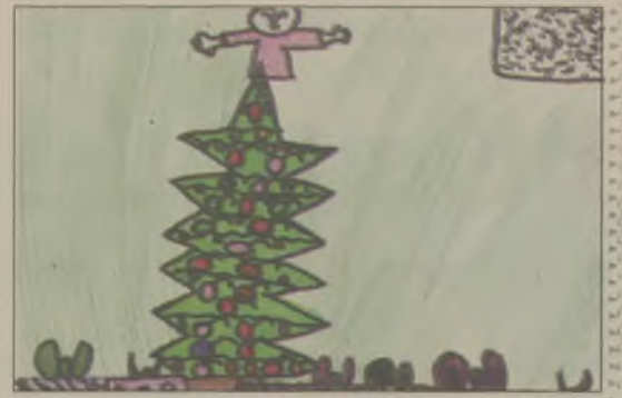
Students' Christmas Card art, pages 10-11