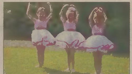
See photos from recent area recital, 9 Officials warn of growing fox population, 7