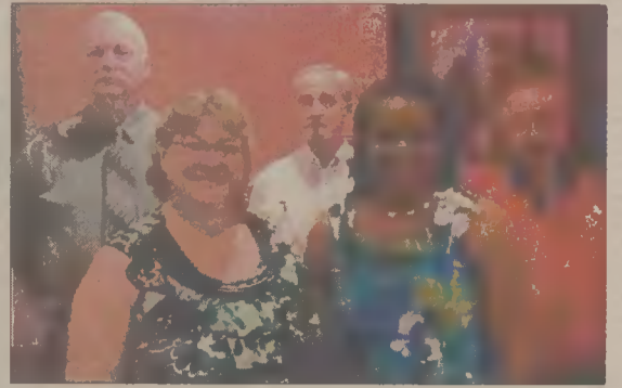
Retirees have 138 years combined service - 4