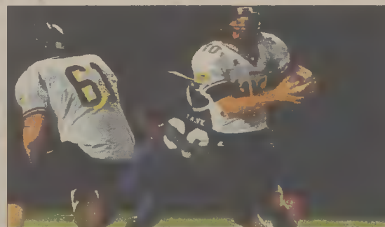
Perquim-WINS! 18-game losing skid over — 9