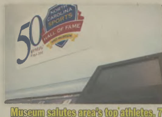
Museum salutes area's top athletes, 7