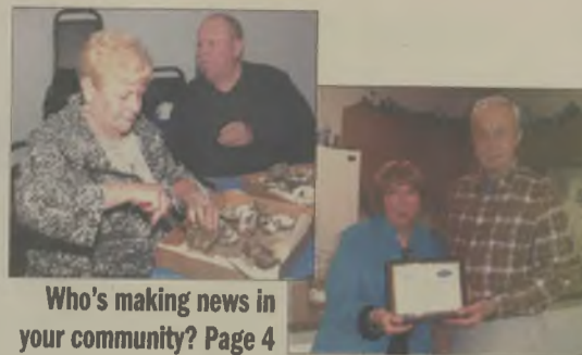
Who's making news in your community? Page 4