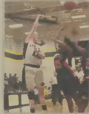
Lady Pirates fighting to preserve playoff berth, 7