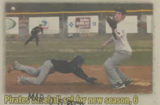
Pirates baseball set for new season, 6