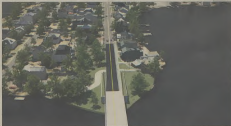
COMPUTER GENERATED RENDERING

DOT's willingness to make modifications in the area of appearance and design isn't 100 percent voluntary, McInnis said. Some things it's bound to do by