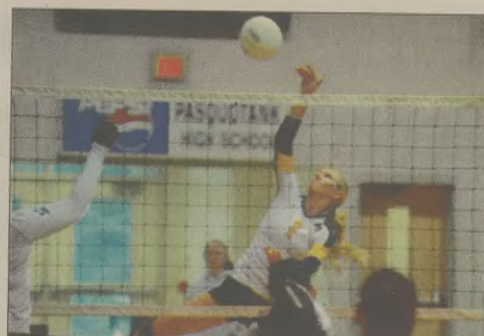
Perquimans volleyball preps for Camden rematch, 7