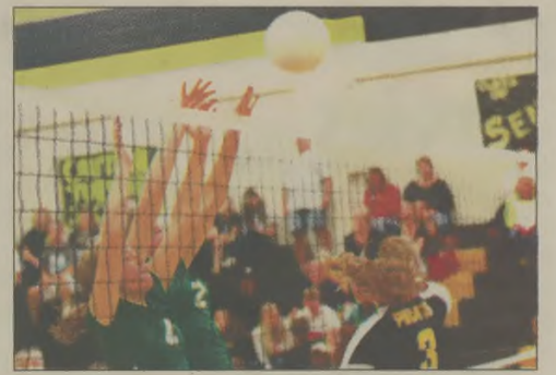
Perquimans volleyball advances, 4