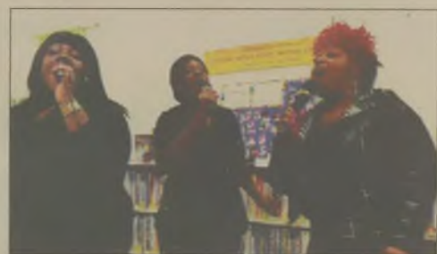
Members of God's Anointed Singers sing at library, 5