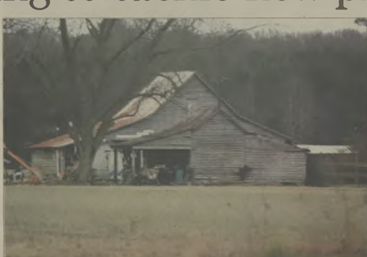
Local photographer Ed Leicester is looking for public input on a project to capture images of old buildings in Perquimans County and Tearn some of their history. This barn is in Bear Swamp.