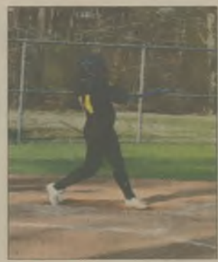
Lady Pirates keep rolling in Coastal 10, 7