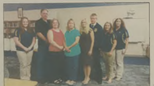
Local FFA Alumni forms, 7