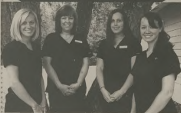
The dental hygiene team at Albemarle Dental Associates.

Modern Dentistry in a relaxed environment for the entire family.