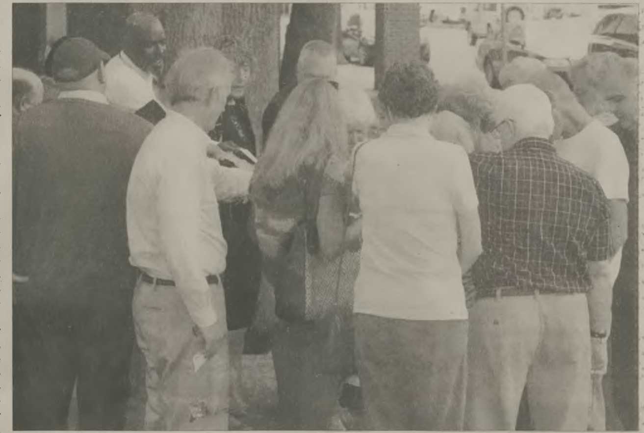
Participants in the Beacon District Prayer Tour pray Sept. 28 in front of the Perquimans County Courthouse.

In a new development, the tour this year not only is reaching the courthouse in every county in the dis-