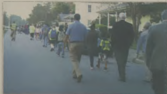
SCHOOLS CELEBRATE WALK TO SCHOOL DAY, 10