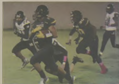
Pirates roll past Mattamuskeet, 6