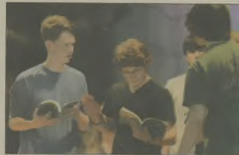
Students to perform play Thursday, Friday, 3