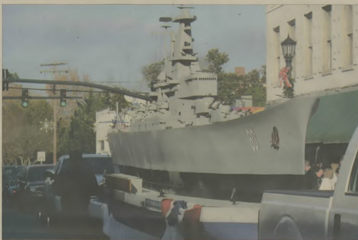
A 55-foot-long replica of the World War II battleship USS Alabama rides down Church Street Saturday in the annual Perquimans County Christmas Parade. The original was built at the Norfolk Navy Yard.