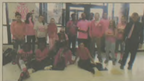
PCHS dress in pink for Breast Cancer Awareness Month, 4