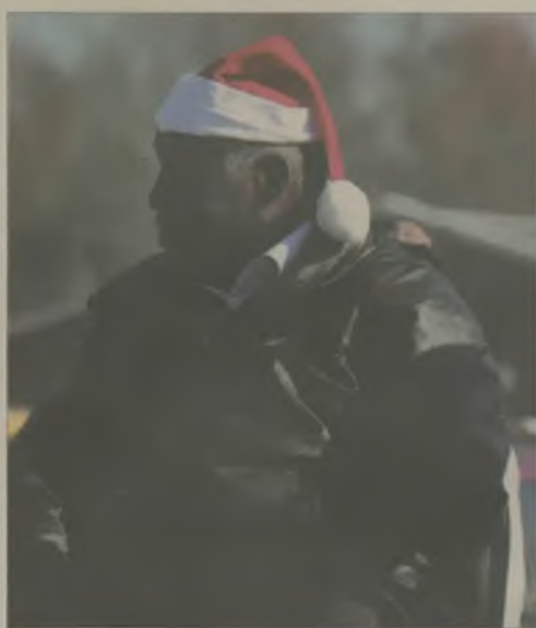
A spectator applauds the Elizabeth City State University band Saturday during the Perquimans County Christmas Parade in Hertford.