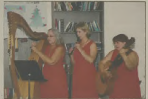
Holiday Island holds 'Island Daze', 3