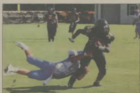
Pirates roll to 53-12 win over private school, 7