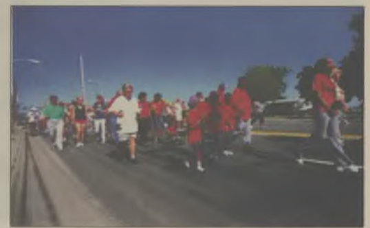
Walk For Hunger set for Sunday, 7