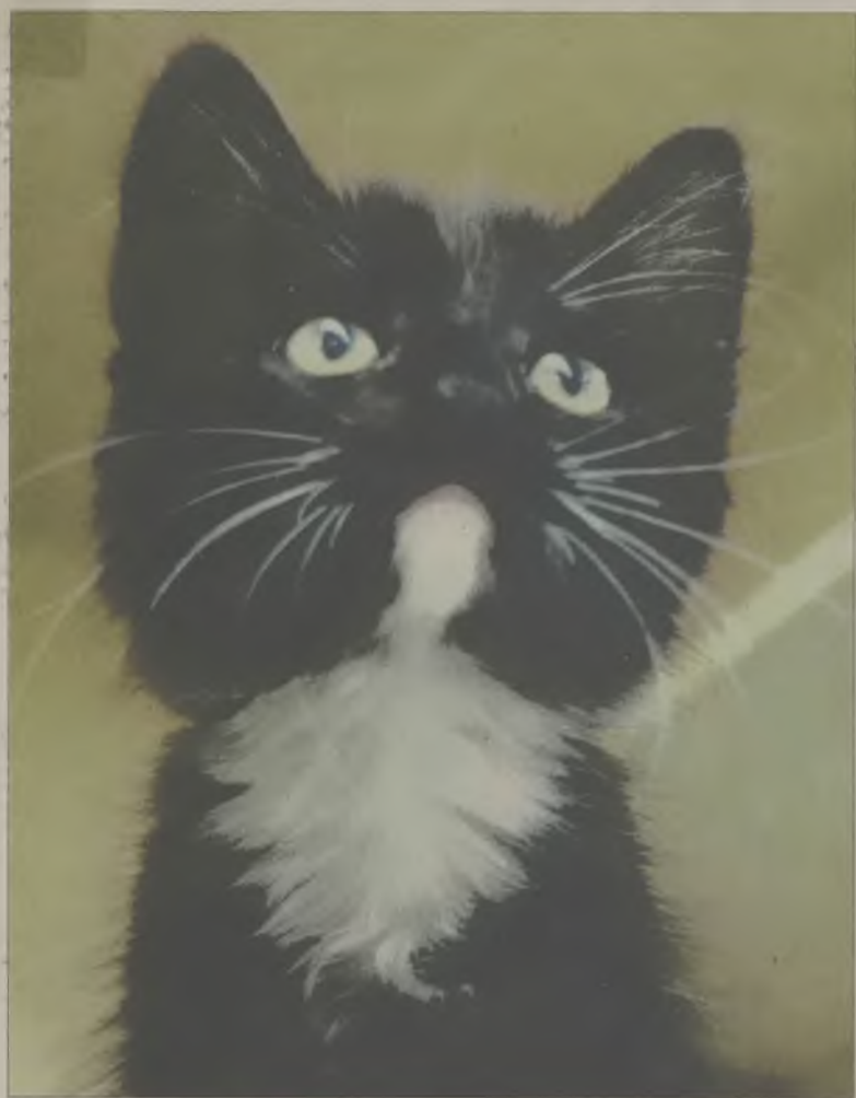
Lucille is a nine-week-old Tuxedo kitten at the Tri-County Animal Shelter. For more information call 221-8514.