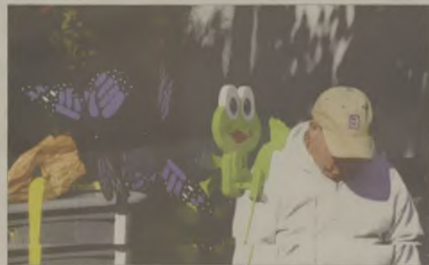
A vendor sells his crafts at Belvidere Day last Saturday.