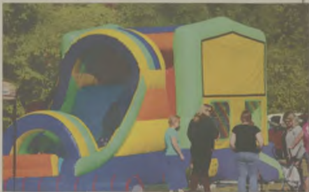
Belvidere Day featured a bounce house for the younger visitors.