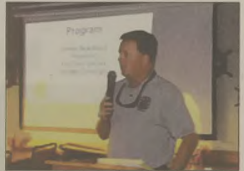
Different speakers talk to Rotary, 5

"News from Next Door" NOV 02 REC'D WEDNESDAY, NOVEMBER 2, 2016