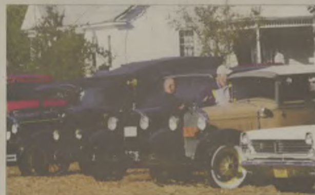
The owners of dozens of classic cars and tractors brought them out for display Saturday during Belvidere Day.