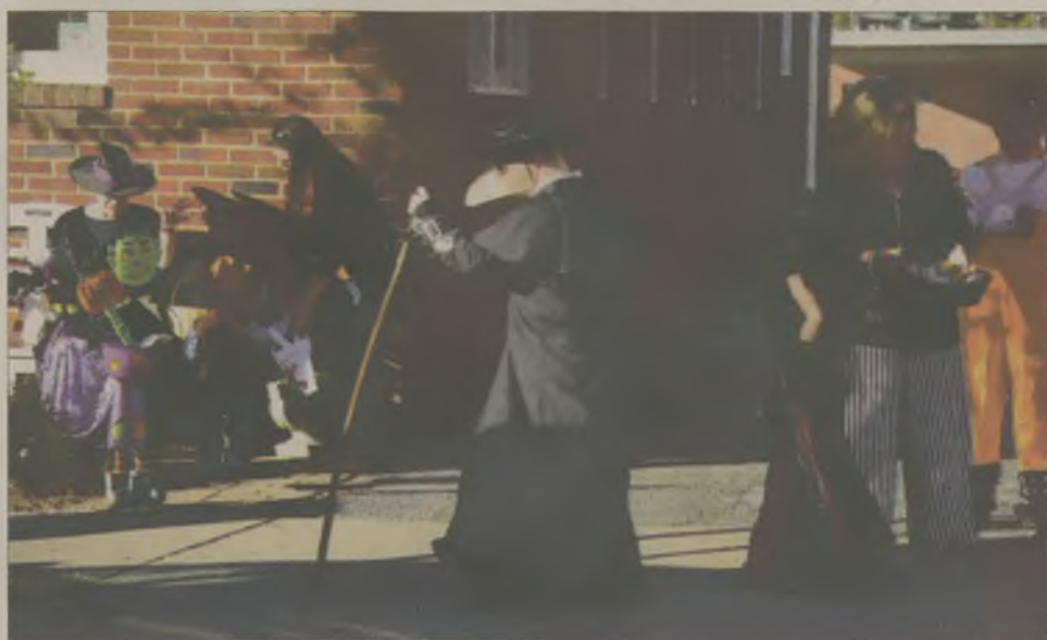
Children go trick-or-treating Monday afternoon on the streets of downtown Hertford.