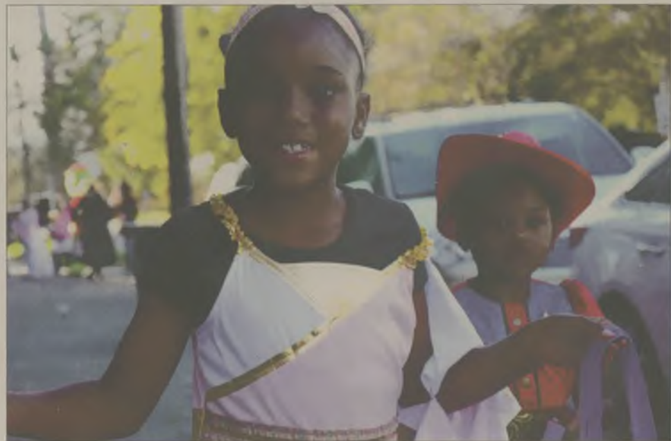
Children go trick-or-treating Monday afternoon on the streets of downtown Hertford.