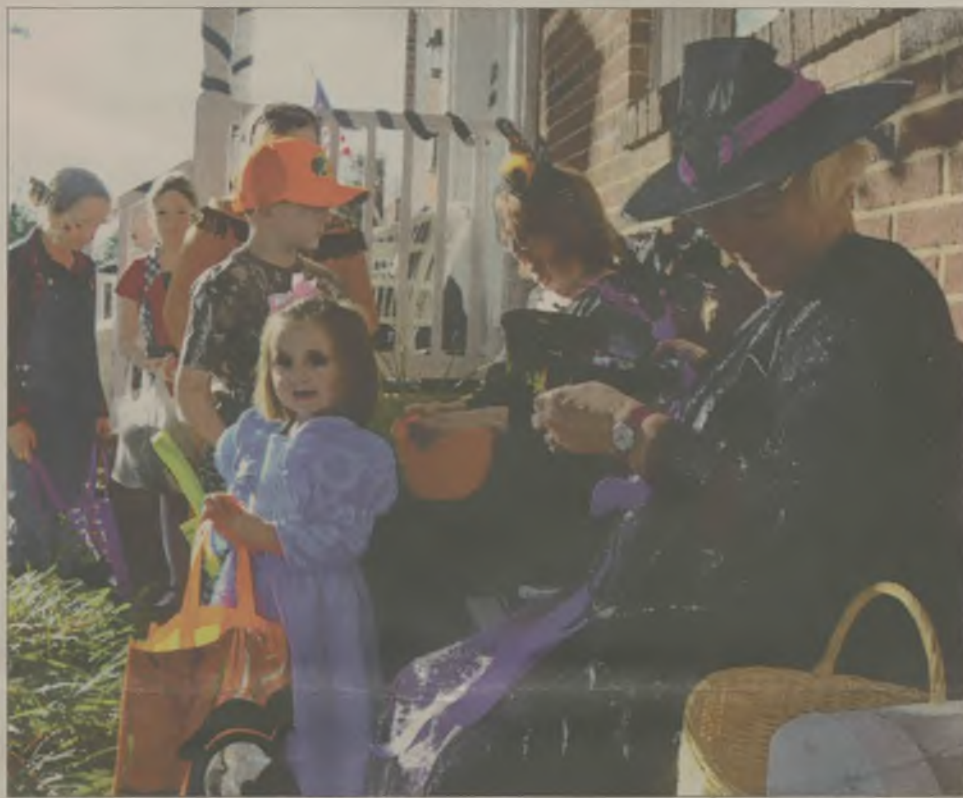
Children go trick-or-treating Monday afternoon on the streets of downtown Hertford.