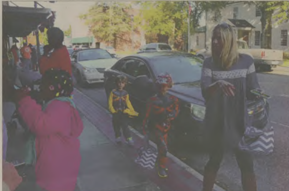
Children go trick-or-treating Monday afternoon on the streets of downtown Hertford.