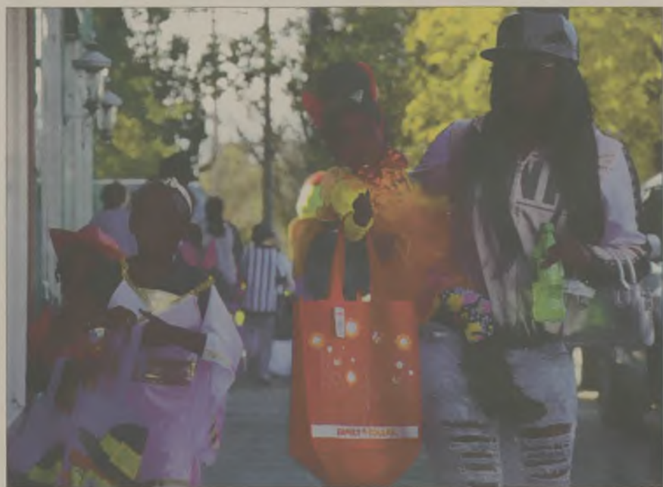
Children go trick-or-treating Monday afternoon on the streets of downtown Hertford.