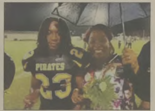
Seniors honored, 8 & 9