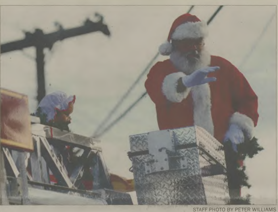
Santa waves to the crowd from the top of the new Hertford Fire Department ladder truck Saturday during the annual Perquimans County Christmas Parade in Hertford.