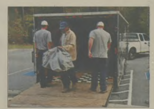
Toy drive to benefit hundreds, 8