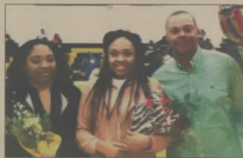
Seniors honored, 6