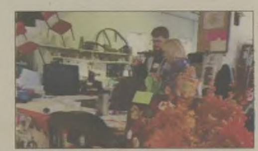
Students learn through shadowing 3