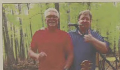
Plough and Friends to perform, 6