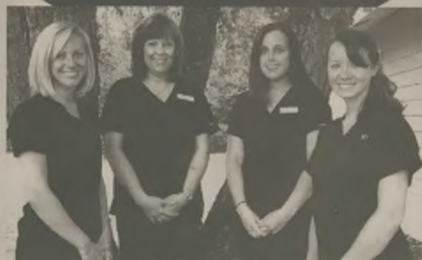
The dental hygiene team at Albemarle Dental Associates.

Modern Dentistry in a relaxed environment for the entire family.