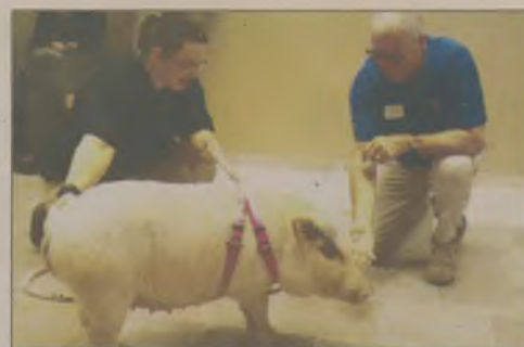
COA to hold 'Pork and Pearls,' 5