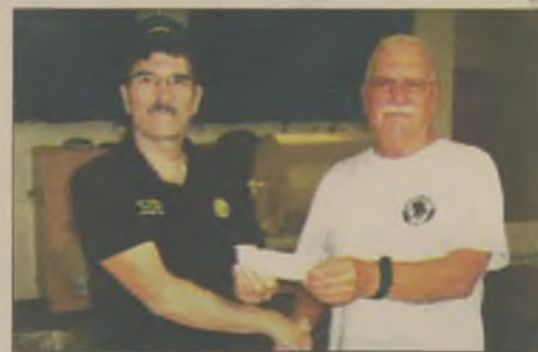
Man wins Legion raffle, 5

P22/C15*****5-DIGIT 27944 PERQUIMANS COUNTY LIBRARY 514 S CHURCH ST HERTFORD NC 27944