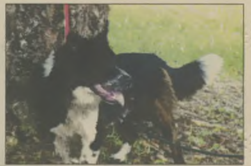
Pets of the Week, 3

P9/C9*****CAR-RT LOT**R 008 A0001 PERQUIMANS COUNTY LIBRARY 514 S CHURCH ST HERTFORD NC 27944-1225