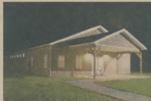
Housing facility dedicated, 9

P9/C9*****CAR-RT LOT**R 008 D0017 PERQUIMANS COUNTY LIBRARY 514 S CHURCH ST HERTFORD NC 27944-1225