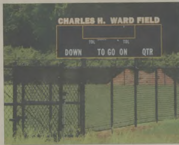
The new scoreboard at Charles H. Ward Field was installed at the new athletic complex at Perquimans County High School last week.