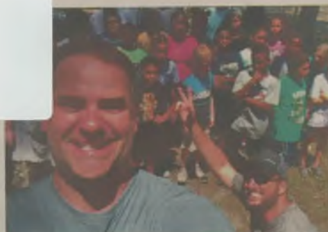
Camp hosts Hunt and Fishing program, 3