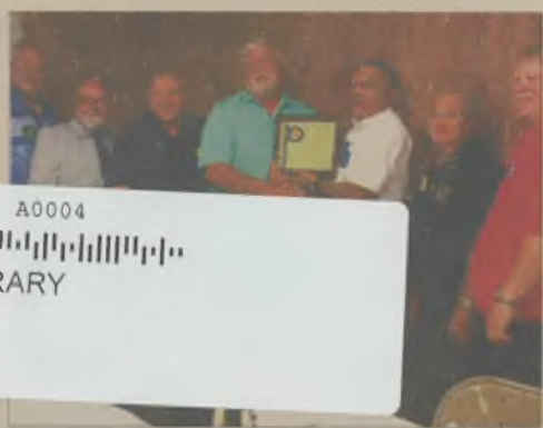
Ruritan Club Celebrates Anniversary, 3

P9/C9*****CAR-RT LOT**R 008 A0004 PERQUIMANS COUNTY LIBRARY 514 S CHURCH ST HERTFORD NC 27944-1225