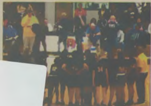
tes fall in AAC title game, A7

P9/C9*****CAR-RT LOT**R 008 A0004 PERQUIMANS COUNTY LIBRARY 514 S CHURCH ST HERTFORD NC 27944-1225