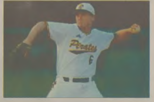
Baseball, softball teams begin season, A7

P9/C9*****CAR-RT LOT**R 008 A0004 PERQUIMANS COUNTY LIBRARY 514 S CHURCH ST HERTFORD NC 27944-1225