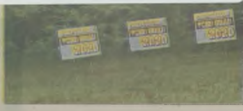
PHS honors Class of 2020, A6-B1