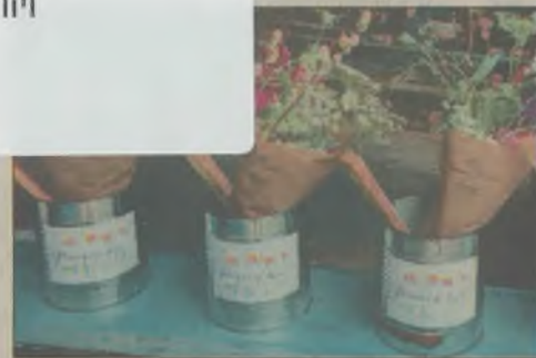
Flower power aids food pantries, A2